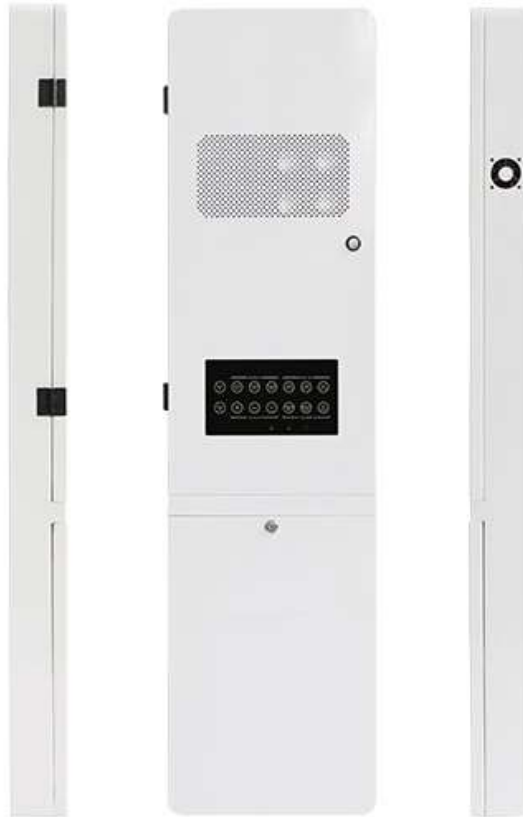
Front & Side Views