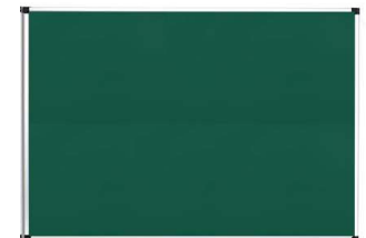
Other option side board